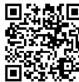
Starter Kit PDF

Save the Chubb Travel Assistance Program Starter Kit and add to your Files in iOS or Android device.