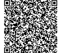
Add vContact Card

Customize and label contact details and note in 'Policyholder Name and Policy Number' from the cutout portion of ID Card below.